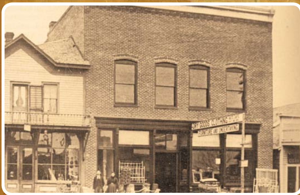
Burman Building 1888